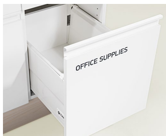
Storage suitable for envelopes, etc.