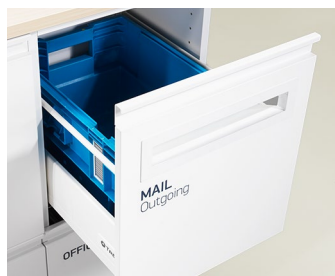
Drawer adapted to the Mail's plastic tray.