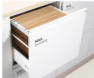
Drawers for hanging folders in folio format, 365x240 mm, c/c 390 mm. Folders are available as accessories.