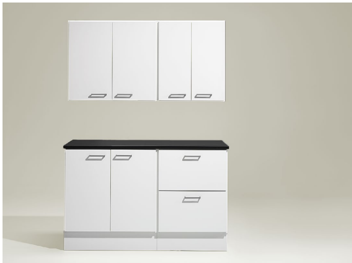
Copy station 3. Ready combination consisting of cabinets and wall cupboards. Length 1420 mm.