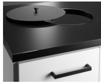
Lid for round inlet.