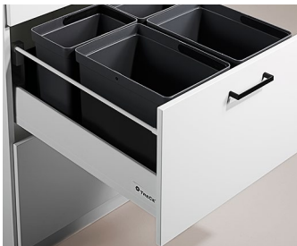
Container 2x19, 2x10 L.