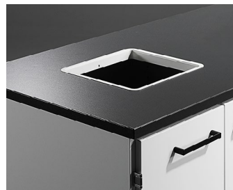
Inlet with lacquered frame in steel, 250x250 mm.