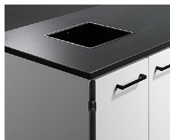
Inlet with lacquered frame in steel, 250x250 mm.