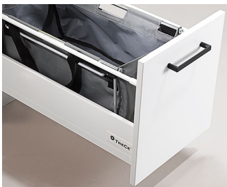
Waste bag 25 L.