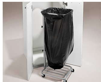
Bag holder, 60–125 L.