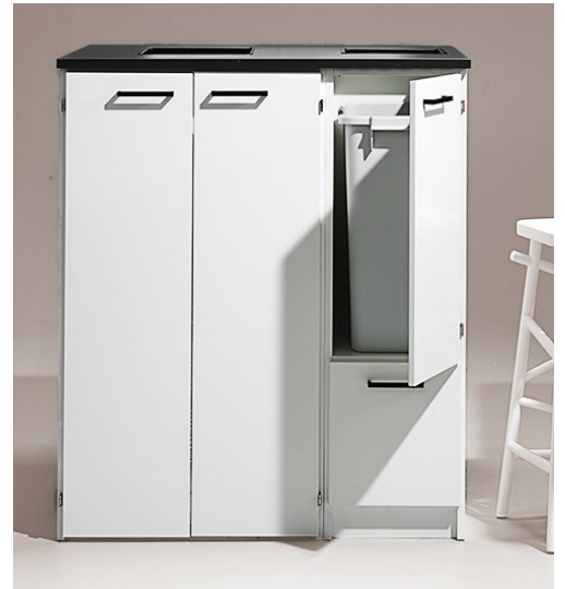
Recycling station with container 60 L.