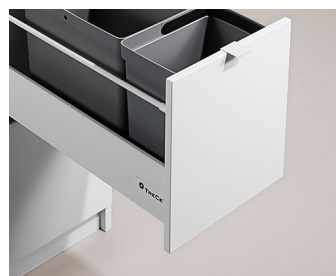
Container 19+10 L.