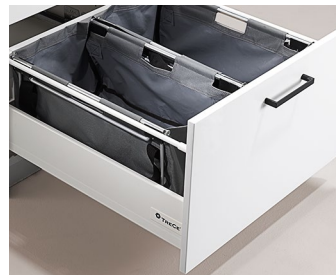
Waste bag 2x25 L. Washable fabric with rubberized inside.