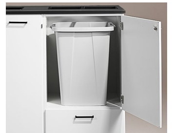
Container 90 L.