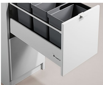
Container 3x10 L.