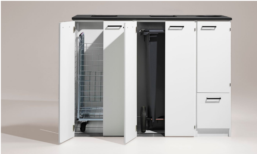
Recycling station with cardboard cart and recycling container on wheels.