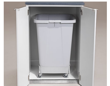
Container 90 L + cart.